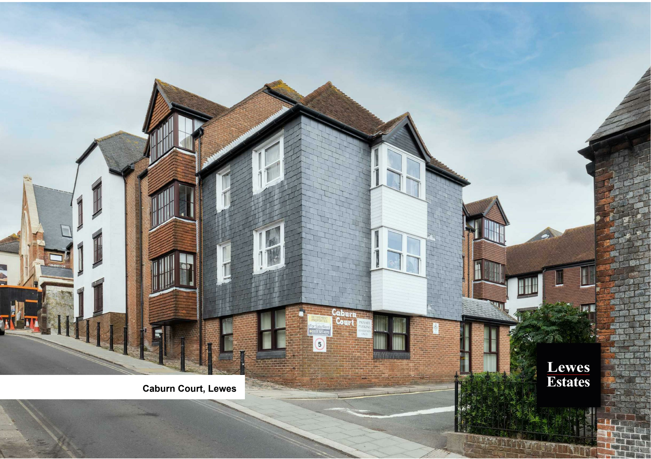
Caburn Court, Lewes